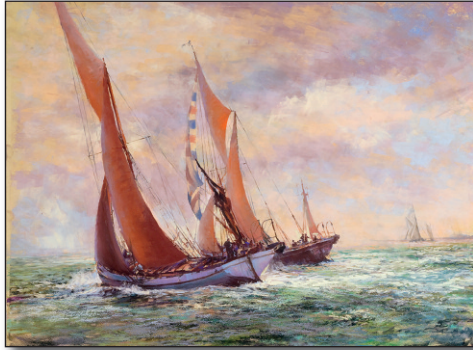
Remainder at close quarter Pin Mill Barge Race. Pastel 60x46cm