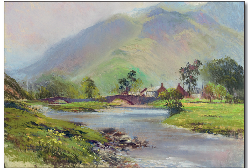
Opposite: Scene near Borrowdale. Pastel 57x41cm