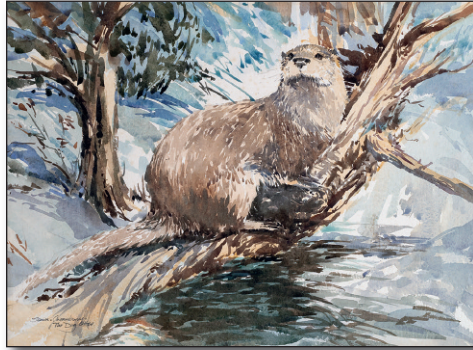
The Dog Otter. Watercolour