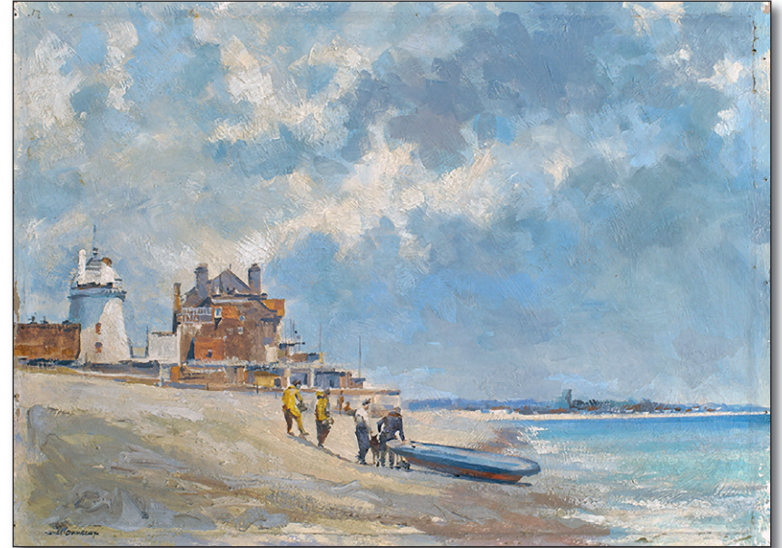
Boatmen on the Beach at Aldeburgh Oil