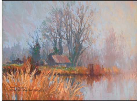
Mist and Reeds, River Brett, Hadleigh, Suffolk. Pastel 33x23cm